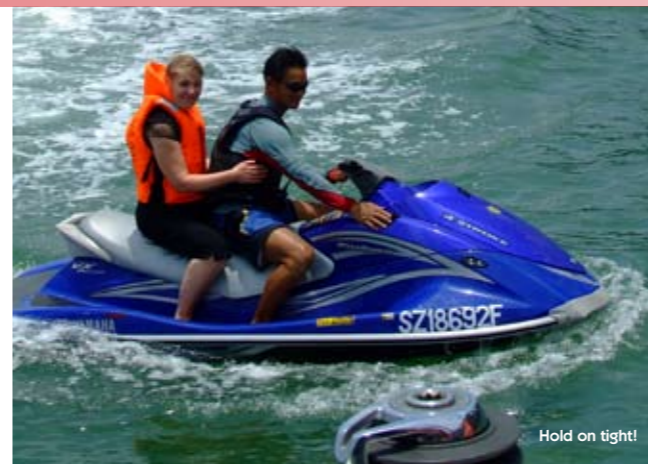
Hold on tight!

While cruising, I thought to myself that it would be really nice to have a family gathering on board. And when you have a big family like