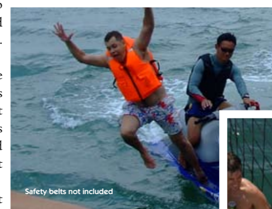
Safety belts not included