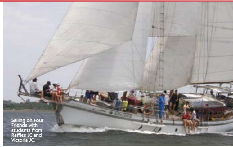
Sailing on Four Friends with students from Raffles JC and Victoria JC.